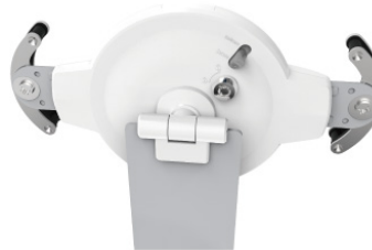
Thin Tablet Holder